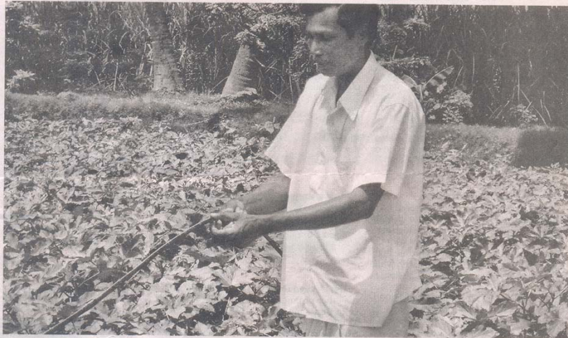
Reaping benefits: A farmer checking his drip irrigation pipeline at a village in Krishnagiri district of Tamil Nadu. He is one of the farmers covered by a precision farming project launched by Tamil Nadu Government in about 400 hectares.

Beneficiary farmers enjoy 100 per cent subsidy towards cultivation expenses and drip and fertigation systems. (Rs 40,000 plus Rs 75,000 a hectare) in the first year. In the second year, the farmers contribute 10 per cent of the margin money (Rs 11,500) and during the third year, they contribute 20 per cent of the amount (Rs 23,000).