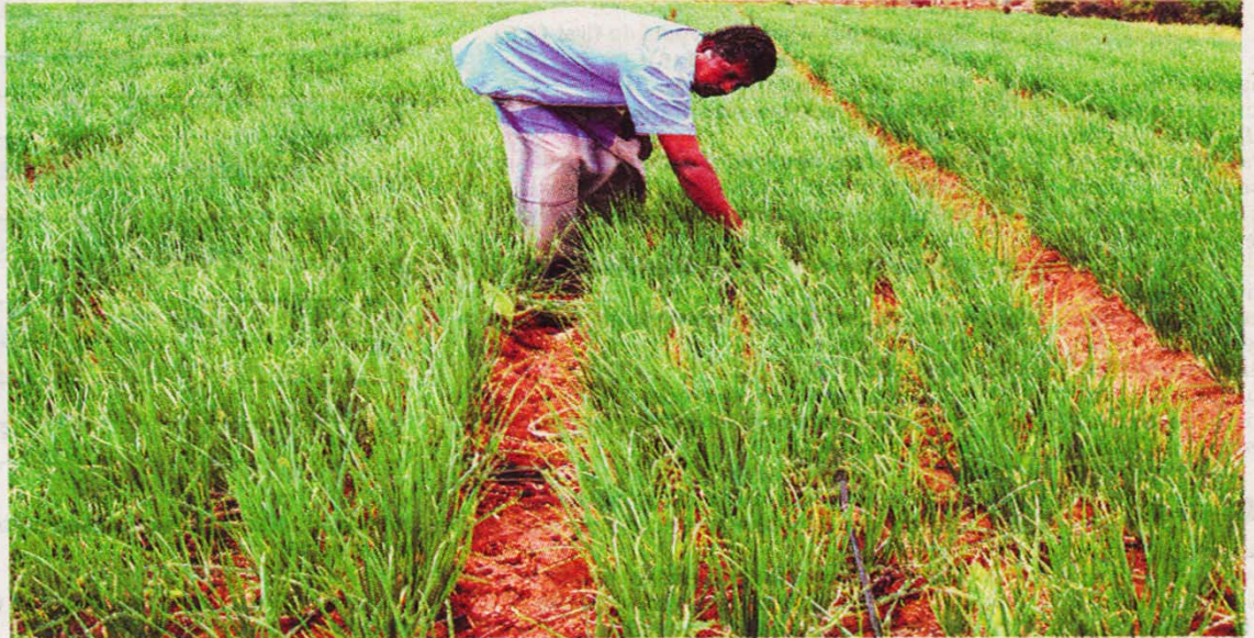
REAPING BENEFITS: A farmer in Tirupur block checking his crops raised under precision farming methodology.

Under the scheme, the department extended subsidy assistance to help the bene-